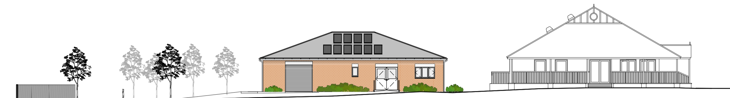
ELV Proposed South Elevation 01 1:200