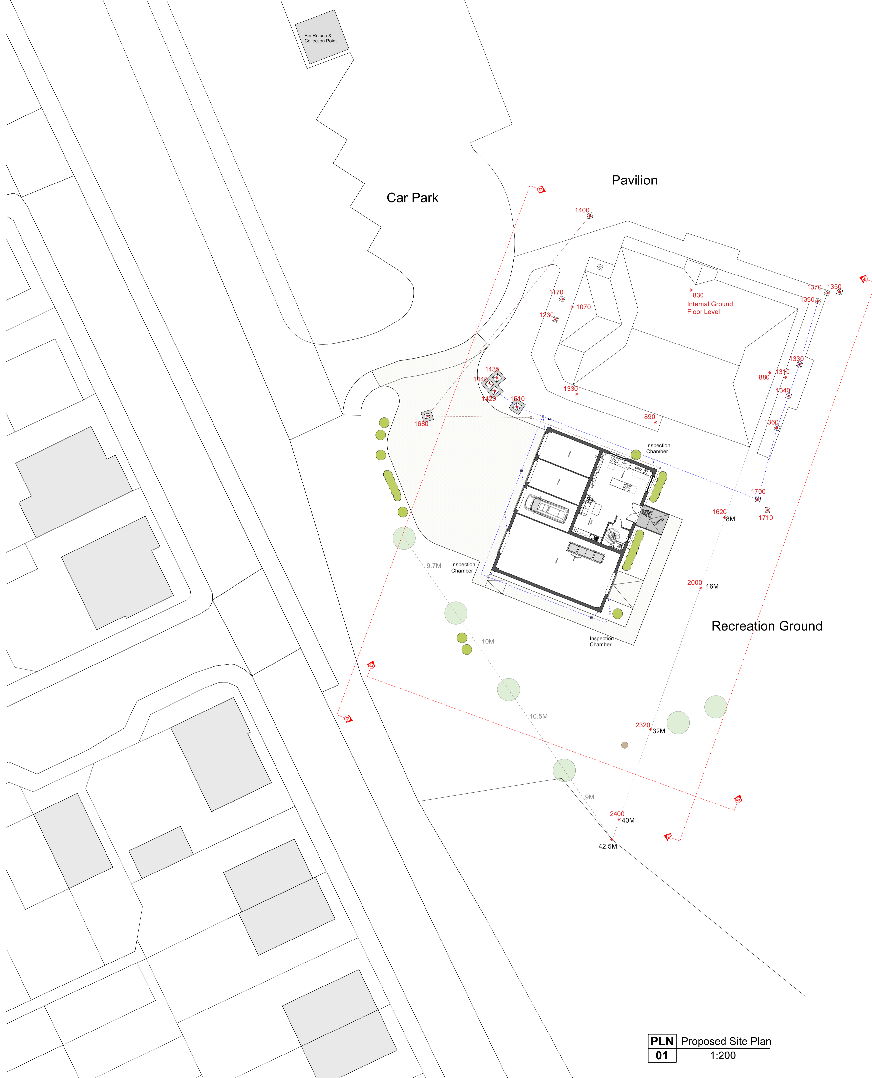
PLN Proposed Site Plan 01 1:200