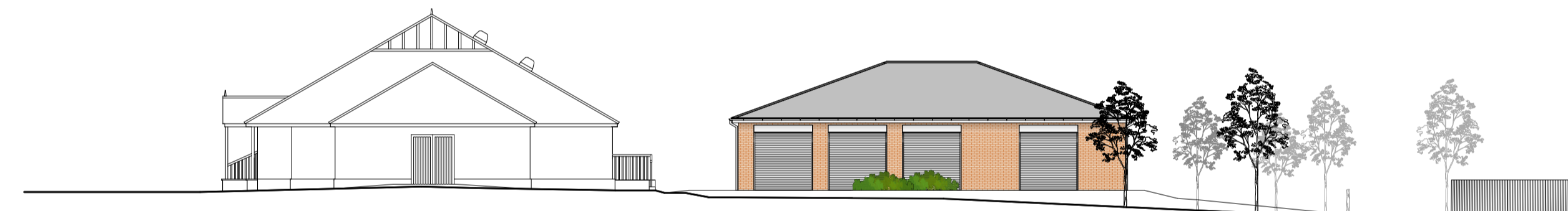
ELV Proposed North Elevation 02 1:200